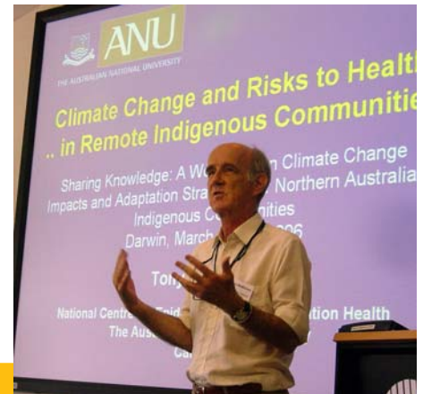
Professor Tony McMichael

Professor Tony McMichael explained some of the risks to health in remote communities in a presentation that emphasized several key climate impacts as outlined in this diagram from his presentation.